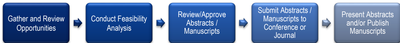
Figure 1: Overview of the NCDR R&P pipeline process

The Research and Publications (R&P) pipeline is the portal through which individuals and organizations can submit research proposals based on the analysis of NCDR data. These proposals are reviewed for scientific merit and undergo a competitive approval process for NCDR funding.