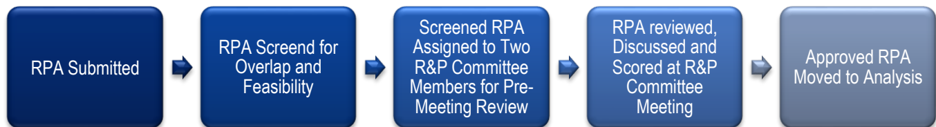
Figure 2: RPA Review and Approval